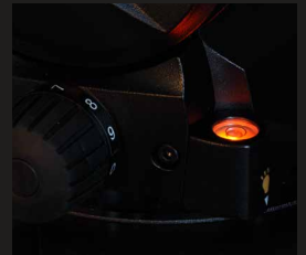
Illuminated Bubble Level

The SX300 is an EFP pan and tilt head with exceptional performance ideal for a wide range of applications including field production, OB or studio use. A robust design with integrated perfect counterbalance is suited to today's portable camera systems with payloads up to 40kg (88lbs).