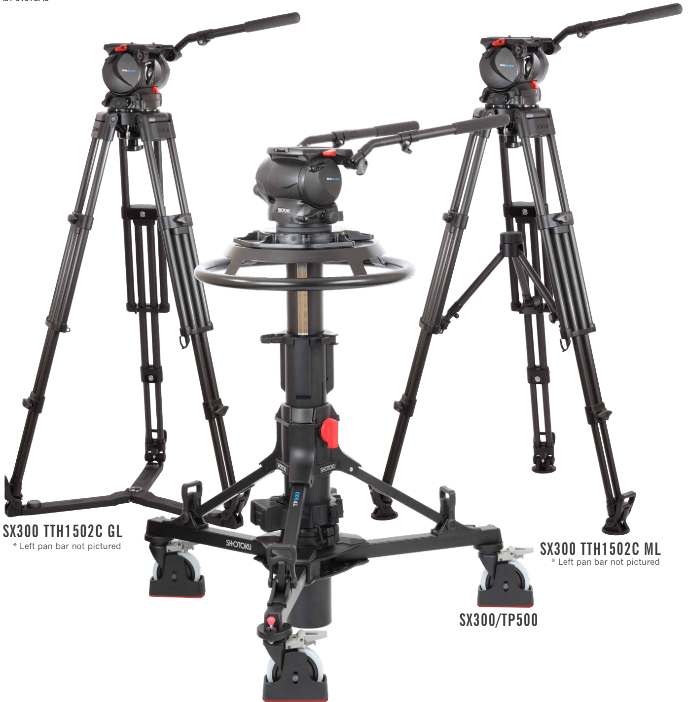
SX300 TTH1502C GL * Left pan bar not pictured