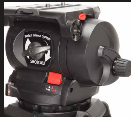
Counterbalance and Tilt Lock